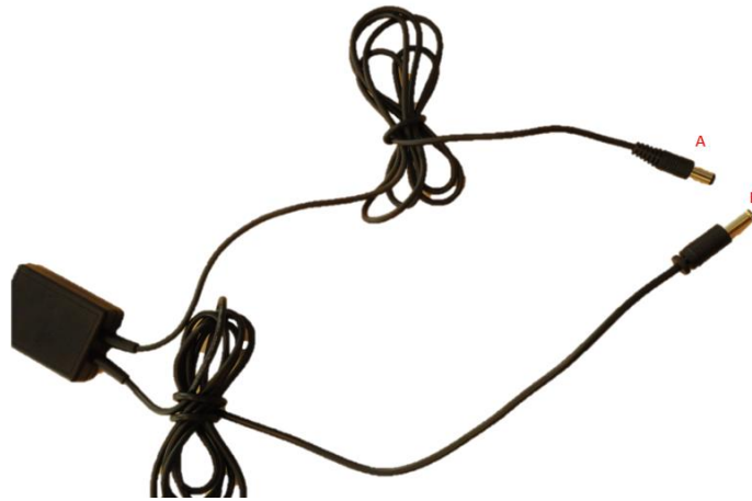
Figure 1. A (shorter) connector to Iris, B connector to MFPA/SCT422.

Steps 2 and 3 are independent and each device can be powered by itself.