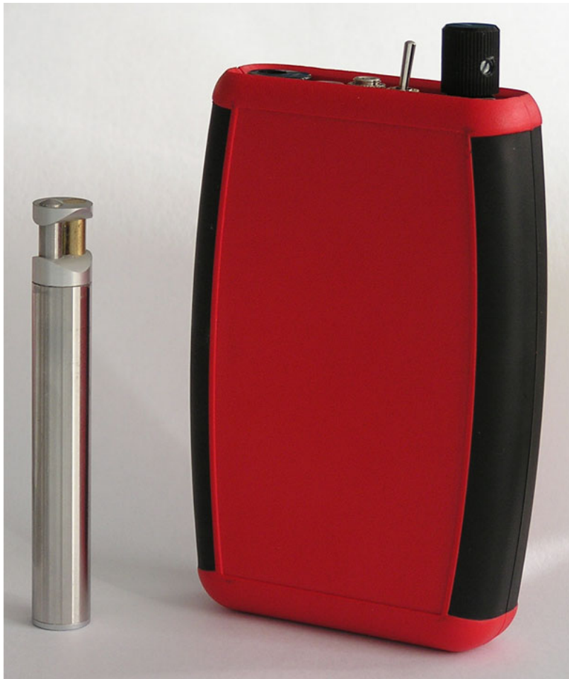
Figure 1: On the left a pu probe which can be connected with a cable to the Scan and Listen device on the right. With a set of headphones both the u and p signal can be listened to instantly.