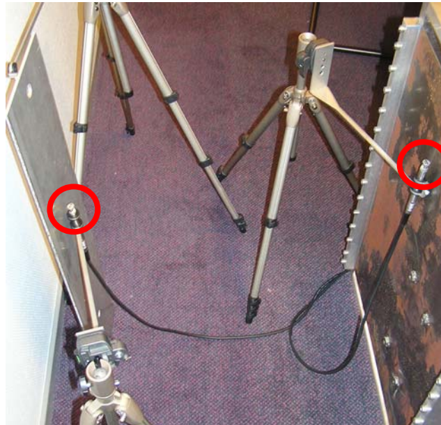
Figure 3: Test setup of the Gong experiment, the hard plate on the left and the gong on the right. The pu probes are inside the red circles.

To show what difference it makes listening to p or u with the Scanner Listener an experiment was done. The experiment is named the Gong experiment. The test setup can be seen in Figure 3.